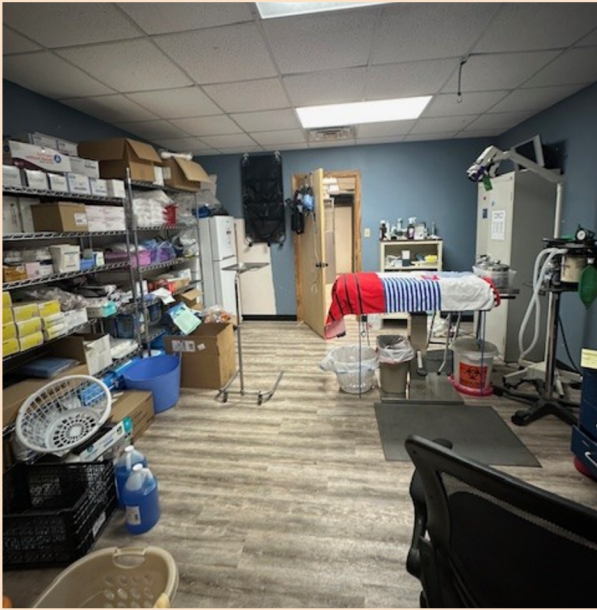
The current operating room, which is not designed as an operating room and is serving many purposes, including storage and record keeping.

The animals in the shelter just want to be loved and cared for—they want their forever family. People choose different kinds of pets for different reasons. For example, my family believes strongly in adopting from shelters, and we are a cat family. Someone else may love a particular breed, like a dachshund. But whether it's a dog or a cat, a purebred or a mix, taking care of and loving animals makes us more compassionate people.