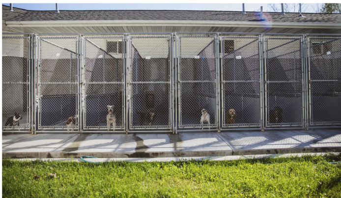
Above are examples of kennels that provide dogs with a choice to move between indoor and outdoor sides of their enclosures. This can help reduce stress and improve their physical and behavioral health.

The size of the shelter was adequate in 1989 but no longer meets the needs of our growing community. When we had the current shelter evaluated, we