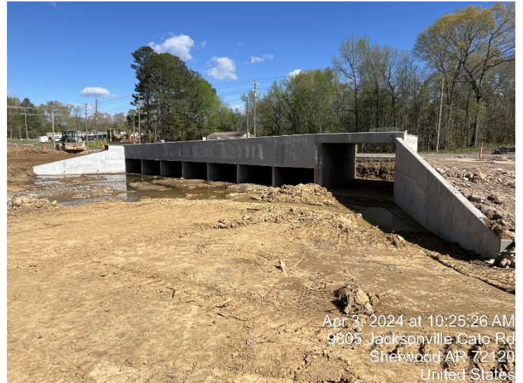
First section of 7 bay box culvert and pedestrian underpass