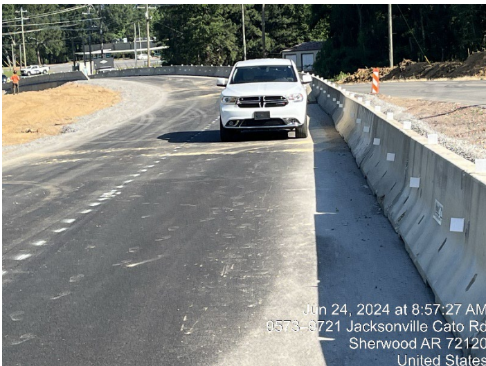
On Detour Road over Bridge

The Rodgers Group has been hard at work milling and leveling different areas where needed. They have also paved the DETOUR road over the new box culvert. Once the temporary barrier wall and striping are completed on Monday, June 24, there will be a lane shift to the detour road. With traffic on the new asphalt, the old box culvert will be removed and Mobley Contractors will complete the construction of the seven bay box culvert and pedestrian underpass.