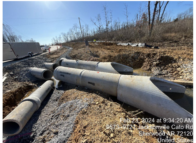
Drainage pipe @ location of junction box.

Crews working on Jacksonville Cato Road have a tough job. With temperatures approaching 100+, temps can be just as high. Please provide these crews with the SAFEST space you can, they want you to get to your destination with minimal delay.