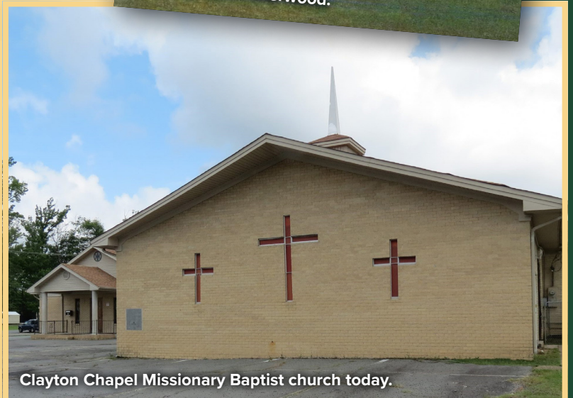
Clayton Chapel Missionary Baptist church today.