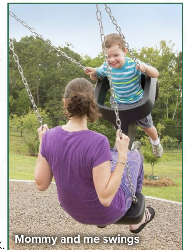
Mommy and me swings

Park improvements will continue. We will add a swing set to Stonehill Park, including a Mommy and Me swing. We will also be adding swings to the area by the playground beside Thornhill Pool. The concession stands at the ballfields will be improved. Bathrooms will be added at the soccer fields at the northwest corner of the Sherwood Sports Complex.