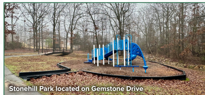
Stonehill Park located on Gemstone Drive

We have monthly events planned that will be happening mainly at this City Hall Park complex as we strive to make this our town center. In March, we will have an Easter egg hunt. We will host the third Thursday of the month live music series in April, May, June, and September. Each month will highlight different kinds of music, such as contemporary Christian, Country, and 80s and 70s cover bands. We must play "September" by Earth, Wind and Fire in September.