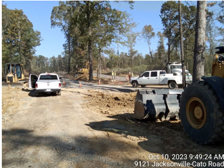
Silt fence and rock check dams at creek/bridge city limit

Oct 10, 2023 9:49:24 AM 9121 Jacksonville-Cato Road