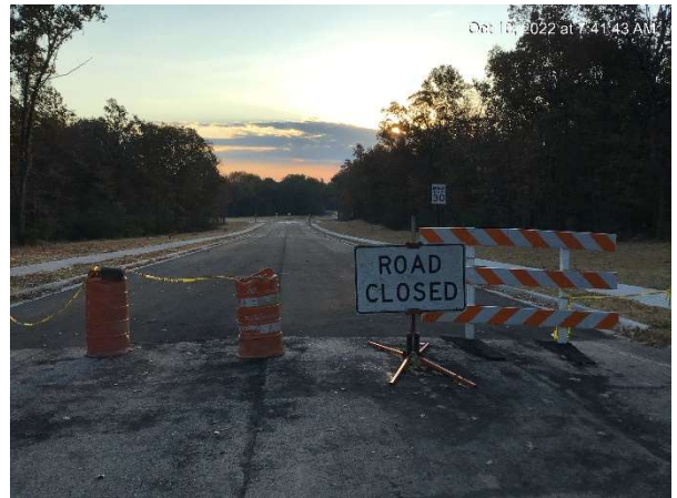
Maryland @ Raywood (After)