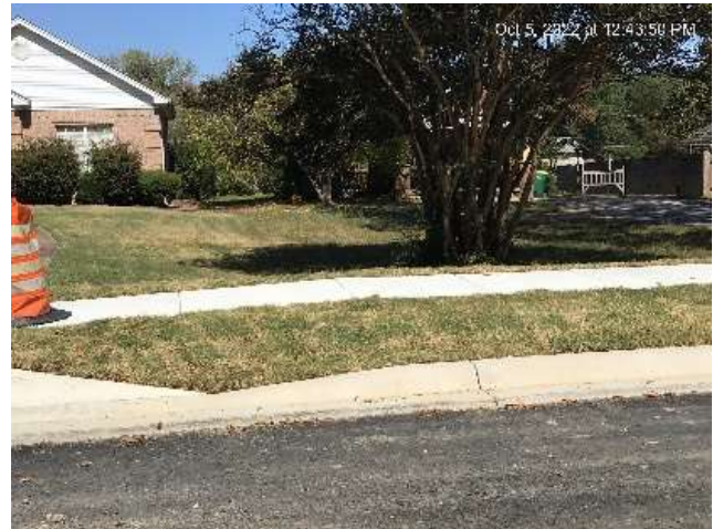
Binder, Curb & Gutter, ADA Sidewalk and Sod