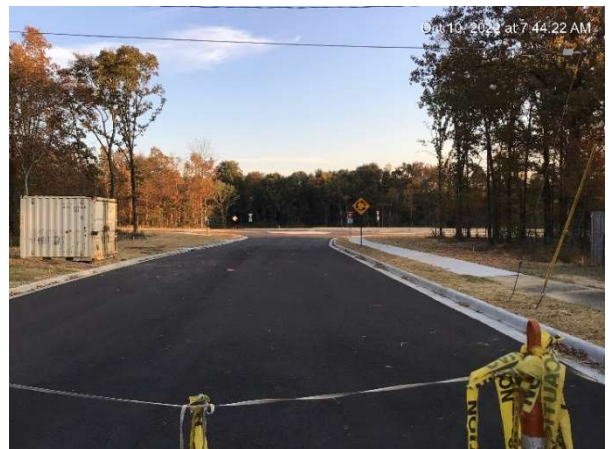
Willow Grove (After)