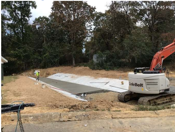
Ditch Paving adjacent to N. Beverly Avenue

Weaver-Bailey crews are taking advantage of the extremely dry conditions. While the drought is harsh on lawns and landscaping, it makes for excellent road building conditions. Noticeable progress has been achieved throughout the project. Curb/gutter has now been installed from Beaconsfield to the intersection of Devon Avenue. A separate crew is forming stormwater inlet box tops, having progressed to approximately Verona Avenue. Driveway aprons are being formed with concrete to soon follow. Excavation, compacting of soil and wooden forms are making progress toward American with Disabilities (ADA) sidewalks and ramps. Soil stabilization with corresponding “roll tests” took place from Glenora Avenue to Sherwood Avenue and SB-2 rock now forms the road base. The supply chain delay involving stormwater reinforced concrete pipe (RCP) continues. The company supplying the RCP is anticipating delivery soon, no date given. Concrete ditch paving has started at N. Beverly Avenue. Sod has been applied to bare ground from Beaconsfield Road to past Claremont Avenue. The newly installed traffic signal with pedestrian crossing lights at Verona Avenue is close to complete, with power and control wiring being connected. Use of a water truck is keeping the sod green during this dry spell.