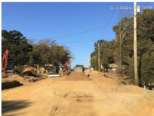
Maryland Place / Maryland Cove

Gene Summers Construction crews have completed the installation of (RCP) stormwater drainage pipes along Maryland Avenue cutting the final road crossing across Maryland Place. Undercutting and removal of the existing roadway continues and suitable fill material is brought in and compacted into place. Inlet box covers and driveways are getting poured and additional sections of sidewalk are being completed.