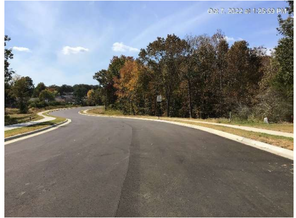
Maryland @ Stonehill (After)