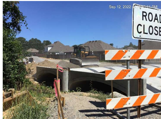
Wing wall still needs to be installed.