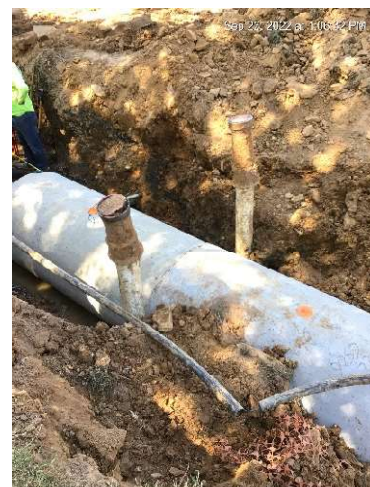
Stormwater Pipe Just Fit.