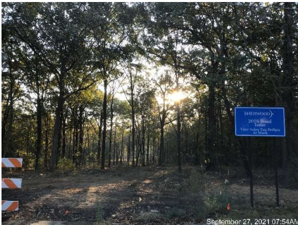
Maryland @ Raywood (Before)