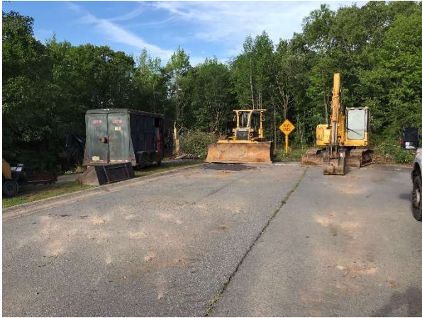
Maryland @ Stonehill (Before)

This project will be completed as soon subsequent striping of the lanes and passing a successful final inspection.