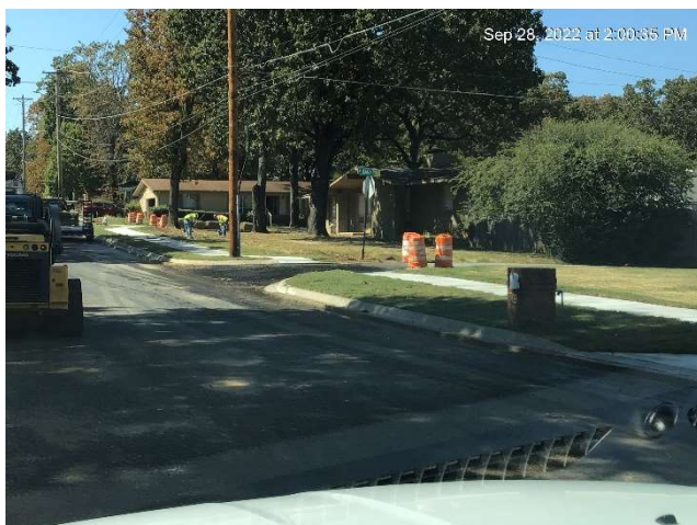
Country Club Road / Abdin Court