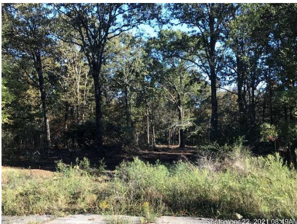
Willow Grove Road (Before)