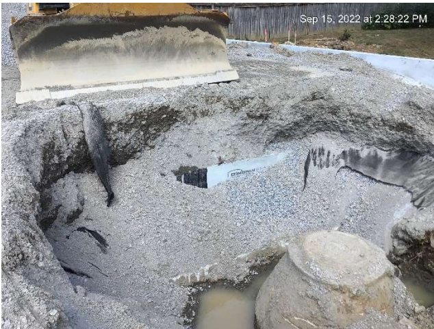
WW Manhole that needs to rise four feet (4').

After a strong start on the Hemphill project, with the installation of the arched bridge, the contractor has pulled off the job sighting the need to relocate some of the utilities. During a meeting held on the project site, city officials voiced concerns over the lack of any measurable progress and the absence of the contractor. This project runs from East Maryland Avenue to East Kiehl Avenue. The project in its entirety stopped, by decision of the contractor, due to several water meters requiring relocation. The city took initiative by communicating with Crafton Tull, whom relayed the city's concerns directly to the contractor; it is evident other areas of the project remain workable in the interim. Therefore, Crafton Tull is requiring the contractor return to work while Central Arkansas Water (CAW) relocates the offending services.