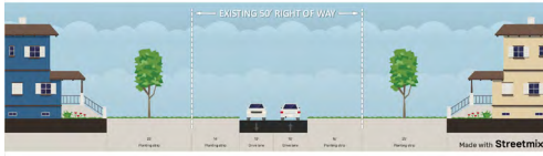
Hemphill Road Street Improvements