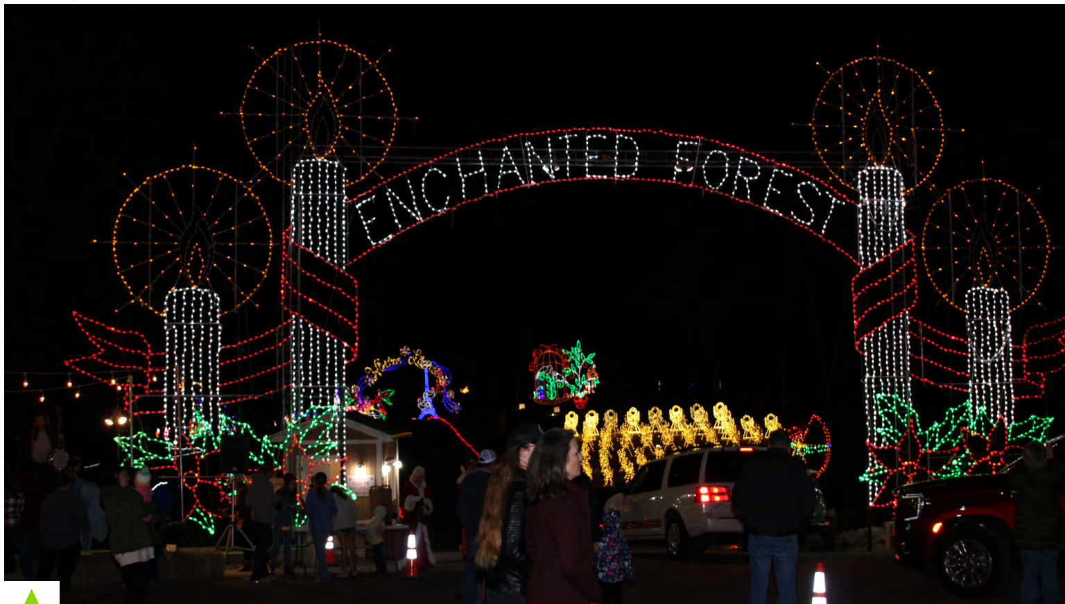
Opening night for the 2021 Trail of Lights included a lighting ceremony to get the season started.