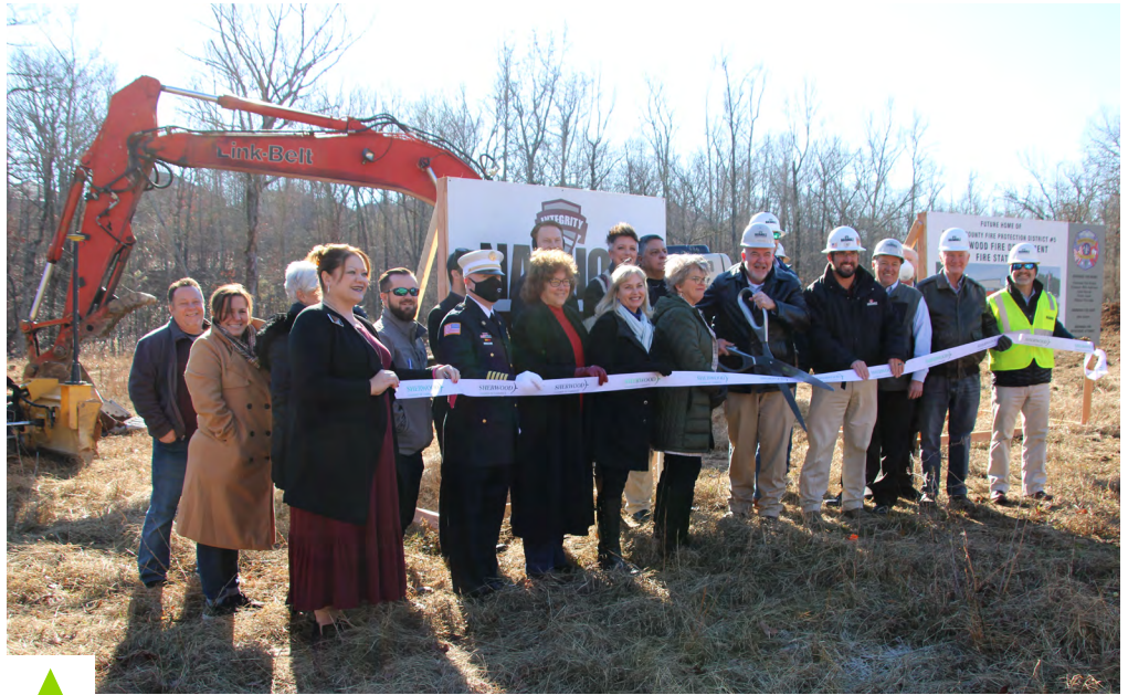
The Sherwood Chamber of Commerce celebrated Conway-based Nabholz Corporation joining the chamber on Tuesday, Jan. 4, 2021, with a ribbon cutting ceremony. They also held a second ground-breaking ceremony at the future site of a new Sherwood Fire Department station on Rapid Water Drive, (which first broke ground in October 2020.)

If a business changes from 2021, the owner must fill out a new application and place it on file. For businesses that are no longer in operation, the business owner must notify the City Clerk's office at 501-835-5319.