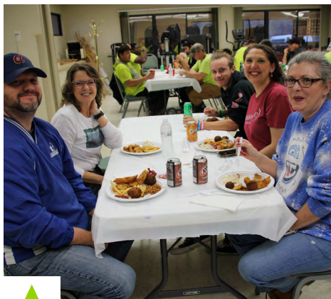
Parks & Recreation Department employees enjoy their meals.