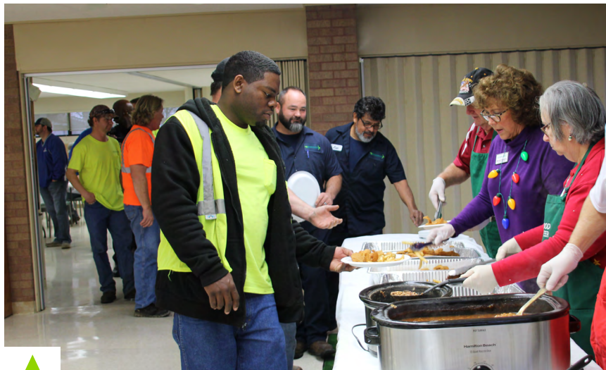
Public Works Department crew members line up to fill their plate during the luncheon. Catfish, fried chicken and assorted sides were served.